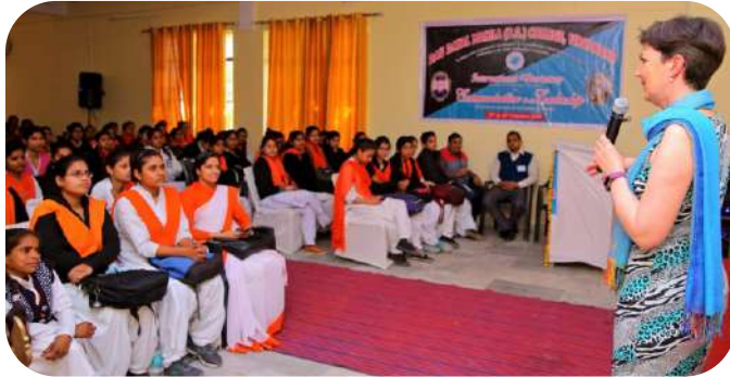
International Workshop on Communication & Leadership